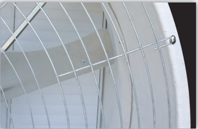
Heavy duty guard is hot dip galvanized after welding to protect from corrosion.